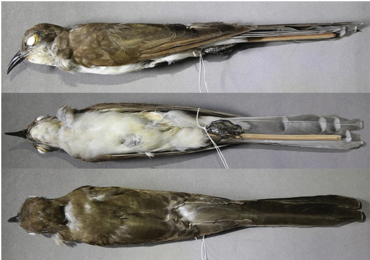
Figure 2. Male Black-billed Cuckoo deposited in the ornithological collection of the Museu Paraense Emílio Goeldi, MPEG4807.

remiges of a slight rust tone and light spots on the coverts of the primaries and rectrices, presenting the following measurements: total length 377 mm, wing length 137 mm, wingspan 384 mm, tail length 144 mm, culmen 24 mm, tarsus 25 mm, and total weight 50 g. Coloration soon after the collision included an intense yellow periophthalmic ring, a greenish yellow mandible base and a light brown iris, which changed color after freezing (Fig. 3A-H).