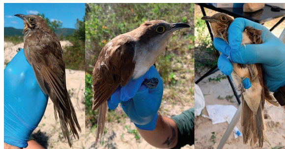
Figure 5. Black-billed Cuckoo captured in Santa Catarina State.