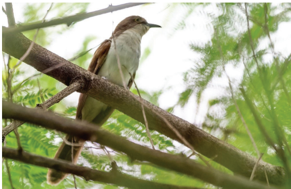
Figure 4. Black-billed Cuckoo recorded in Rio de Janeiro State. (Photos by Guilherme Alves Serpa).