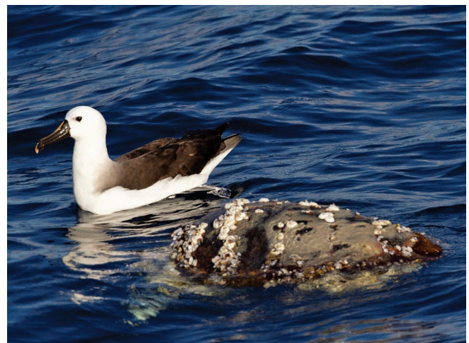
Fig. 2. Detail of the carcass of the Loggerhead Sea Turtle Caretta caretta.