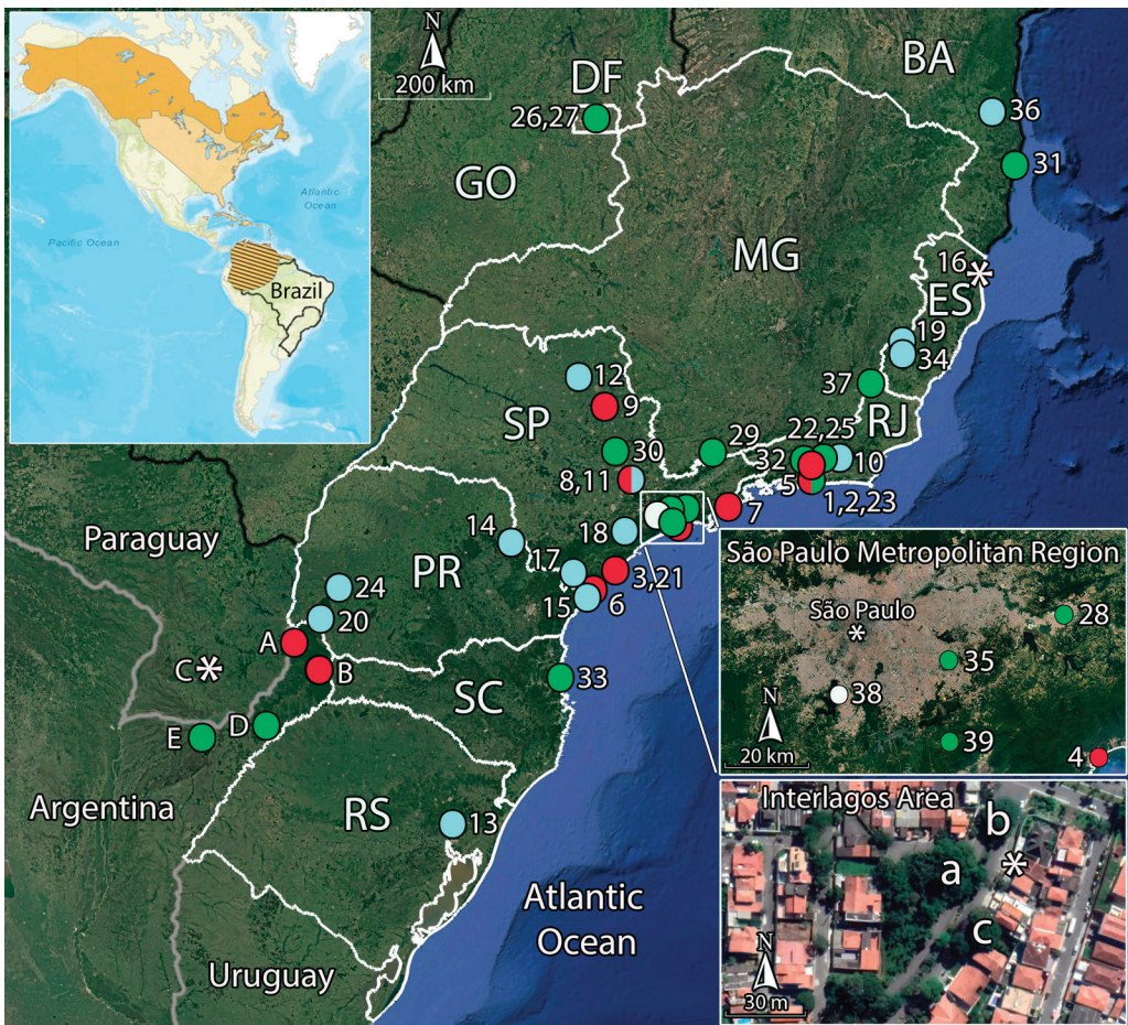
Figure 1. Records of Blackpoll Warbler Setophaga striata in Brazil outside the Amazon. Inset of the Americas (upper left): dark beige = the species' breeding range (northern North America); pale beige = passage (eastern North America, the Caribbean and parts of Middle America) and dark beige + hatch is the main non-breeding area, in northern South America including Amazonia (from BirdLife International 2021). South-east and south Brazil are outlined in black and represented by white borders on the main map, with coloured points on this and the inset of metropolitan São Paulo as follows: red = historical records (specimens and field records between 1969 and 1978); blue = contemporary records in the literature (undocumented sight records from the 1980s, 1990s and 2000s); green = contemporary records on online platforms (documented records starting in 2007); and white = author's field record. Asterisks indicate the two localities mentioned by Paynter (1995), but not otherwise traced. Localities A–E are in Argentina and Paraguay. Brazil state acronyms: GO = Goiás (centre-west region); BA = Bahia (north-east); MG = Minas Gerais, ES = Espírito Santo, SP = São Paulo and RJ = Rio de Janeiro (south-east); PR = Paraná, SC = Santa Catarina and RS = Rio Grande do Sul (south). Inset of Interlagos: (a) forested square; (b) Tipuana tree and (c) Caesalpinia tree. Asterisk indicates the first author's home. Black lines indicate Brazil's borders, grey lines those of other South American countries.

available on request from FS). The bird was observed for an hour, when it moved away and continued calling in the distance.