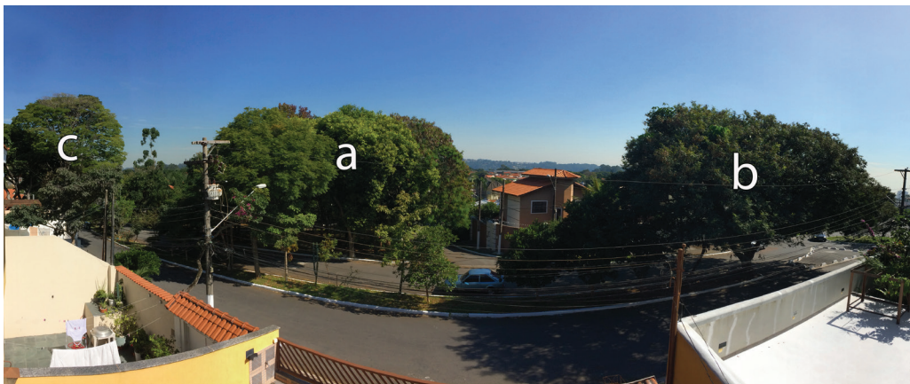
Figure 3. Vegetation at Interlagos, São Paulo, Brazil, in the three areas used by the individual Blackpoll Warbler Setophaga striata : (a) forested square, (b) Tipuana tree and (c) Caesalpinia tree

main sites (a–c) (Fig. 1, Interlagos inset). It spent most time in a large Tipuana tipu tree with a crown of c.350 \text{ m}^2 (area b; Fig. 3b). It usually moved between sites using intermediate trees, but occasionally made flights of c.60 \text{ m} from area b to area c, or vice versa.